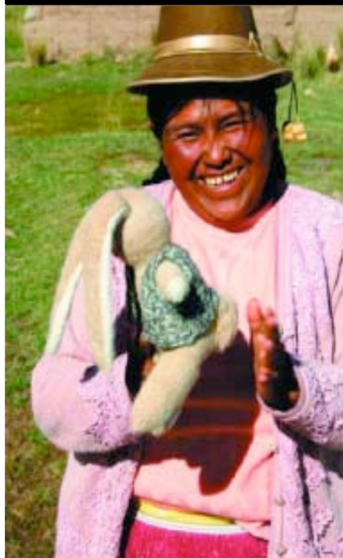
Fair Trade Producer - near Juliaca Peru